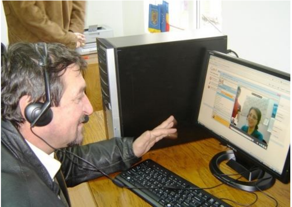
Mayor Dorel Cosma uses the Vadu Crisului library's broadband connect to test video chat on Skype

The Vadu Crisului Library is one of the first partner libraries of the Biblionet program, currently being implemented by IREX. Biblionet libraries all depend on the type of support that Vadu Crisului displays; the local council financed a 750,000 lei (over US$250,000) renovation project for the community center where the library is located. While Biblionet provided the computers and trained the library staff, the