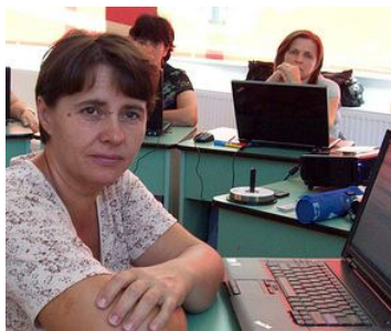
Local librarians in Salaj during office productivity software training.

A total of 150 librarians from Bihor, Constanta, Harghita, Maramures, Salaj and Valcea counties have been trained this month in IT and library management. The librarians are from among the 235 libraries selected to participate in the first round of the Biblionet program and are completing initial training courses before receiving new library computers.