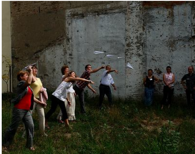
Librarian trainees help launch Biblionet's first ToT session in a team building exercise