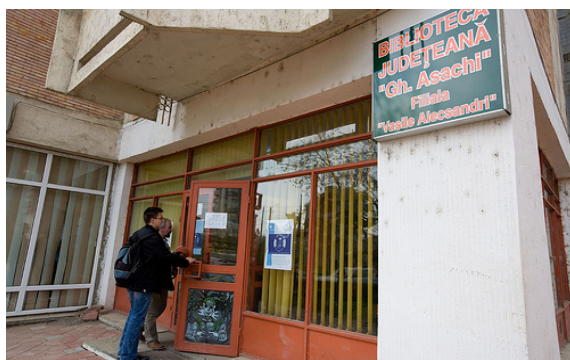
Visitors enter the Iasi County Library. The library was one of the pilot sites that presented at the final conference.