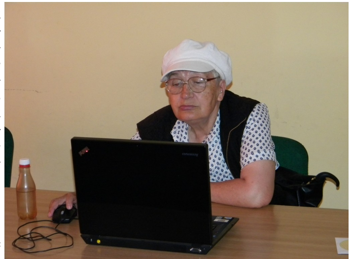
Seniors learn how to edit multimedia and create digital stories about their lives through DigiTales

http://www.youtube.com/watch?v=ljB_XaXoq2k ■