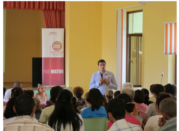
Presenters share facts and personal stories about teenage drinking at the Gheraseni library

Ursus breweries is one of the largest brewers in Romania, and no stranger to the dangers of teenage drinking. Seeking to open up dialogue on the issue between parents, community leaders and teens, Ursus found the perfect venue: local libraries. The space available at the library offers an opportunity to have frank conversations about social issues and connect outreach campaigns with rural communities hoping to help the children that may be struggling with alcohol.