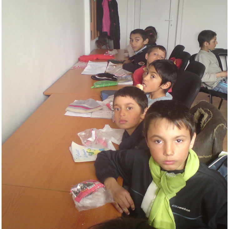
Children come to Radu Rosetti library in Onesti for help with homework, technology training, and fun activities