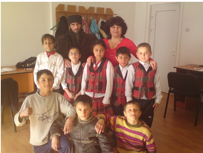
After school club meets at Radu Rosetti library