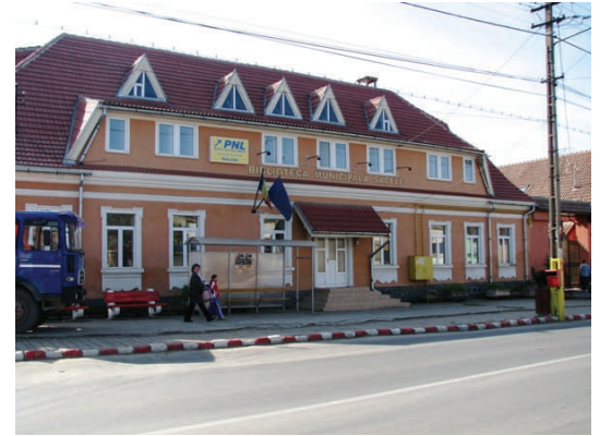
At the Săcele library, residents seek to include their Roma neighbors through civic education and IT training.